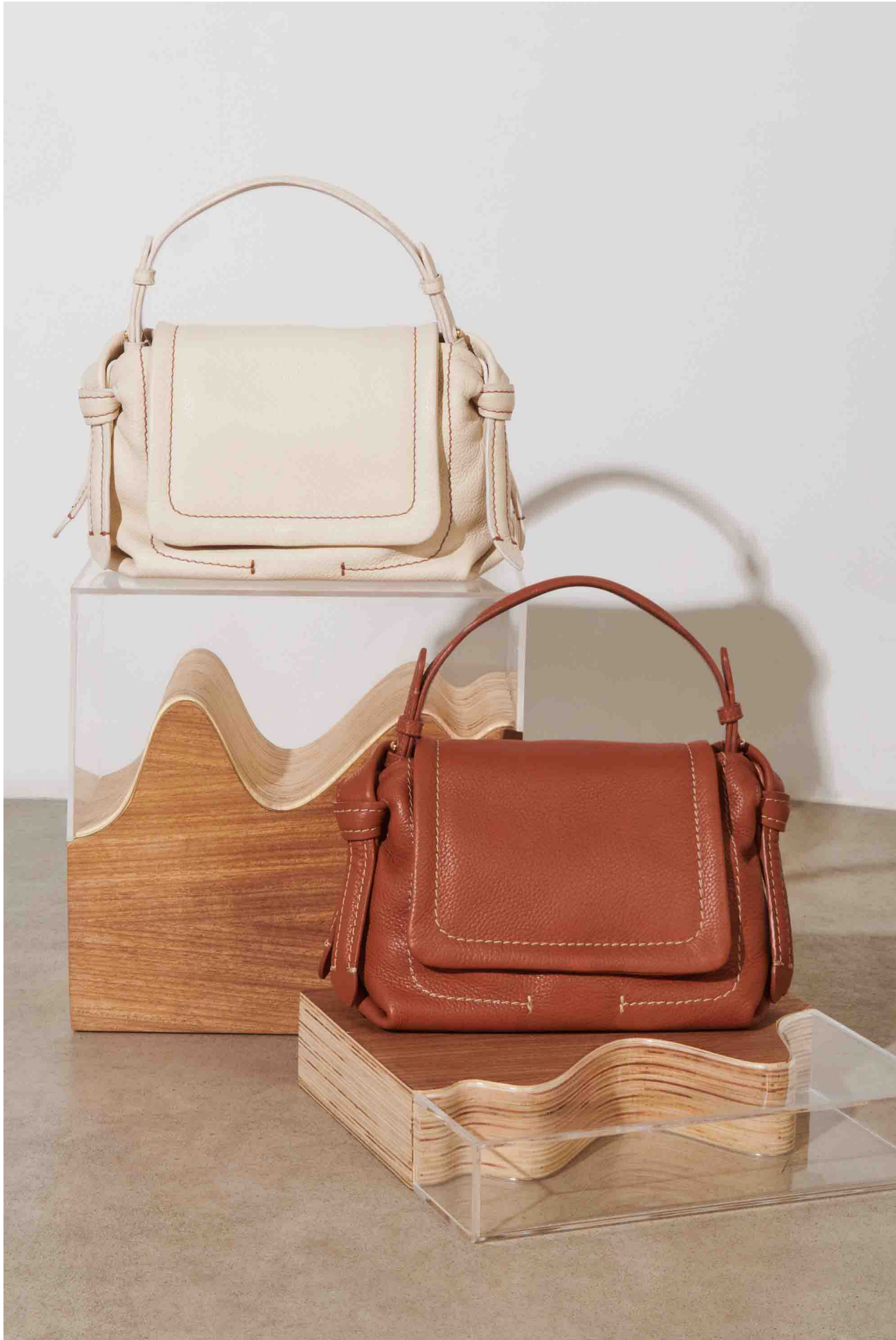
GBF0010W|MV // 849,90